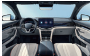
Blue and grey